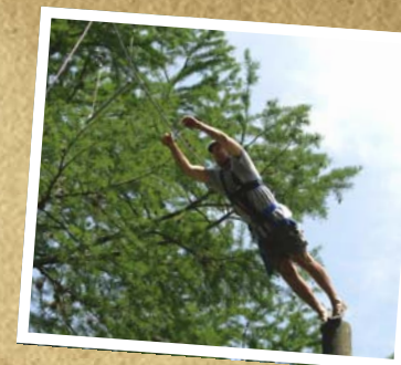
BOOT CAMP 2010