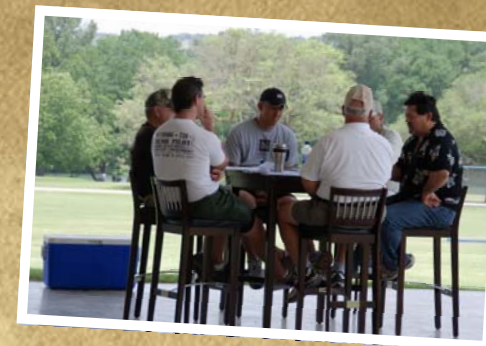
BOOT CAMP 2009

LET US KNOW IF YOU'RE INTERESTED IN JOINING OUR SPECIAL FORCES SERVANTHOOD MINISTRY. WE'LL TACKLE PROJECTS LIKE HELPING OUR NEIGHBORS AND CONGREGATION WITH REPAIRS AT HOME, MENTORING YOUTH AND KIDS WHO NEED A "DAD" IN THEIR LIFE, AND PARTNERING WITH LOVE & CARE MINISTRIES.