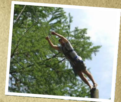
BOOT CAMP 2010