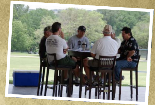
BOOT CAMP 2009

LET US KNOW IF YOU'RE INTERESTED IN JOINING OUR SPECIAL FORCES SERVANTHOOD MINISTRY. WE'LL TACKLE PROJECTS LIKE HELPING OUR NEIGHBORS AND CONGREGATION WITH REPAIRS AT HOME, MENTORING YOUTH AND KIDS WHO NEED A "DAD" IN THEIR LIFE, AND PARTNERING WITH LOVE & CARE MINISTRIES.